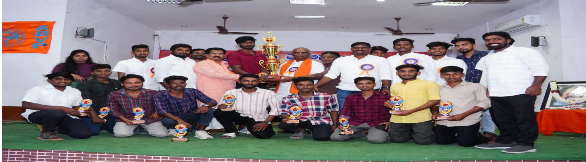
Our Cricket team won First place at University level