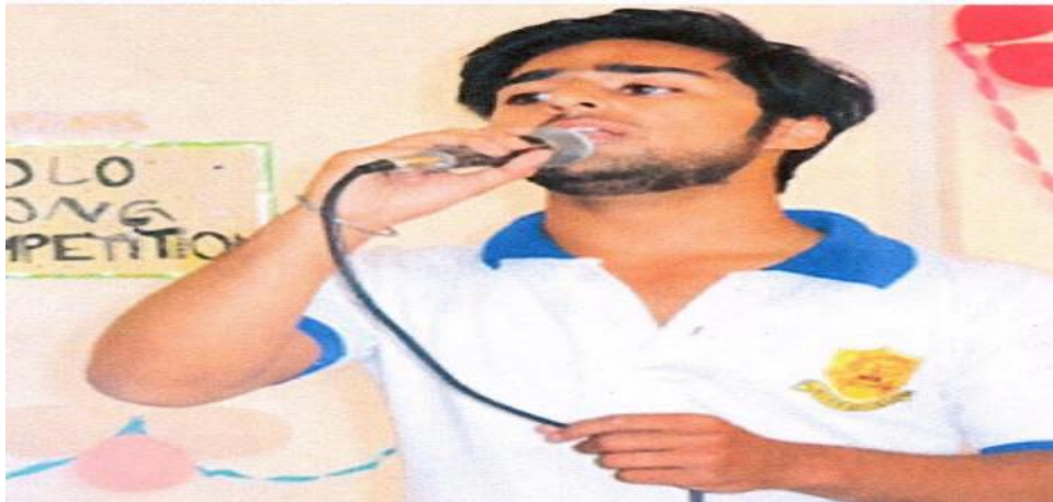
Solo Singing Event