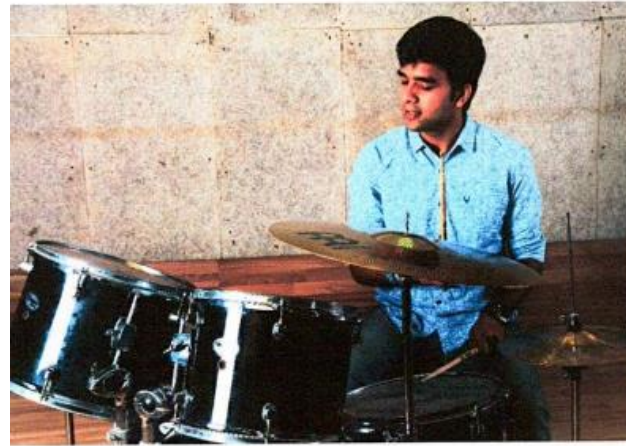
Instrumental Music Competition-2K18

Average No.of Cultural events organized = 15