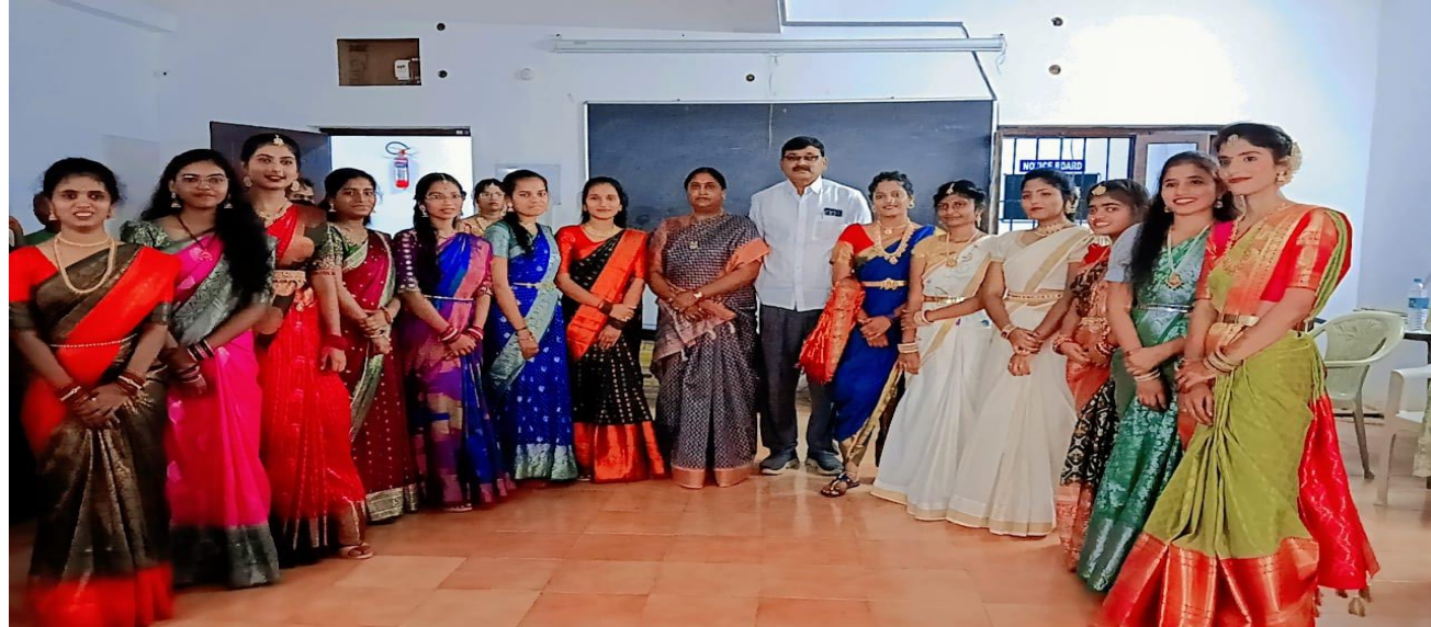
Traditional Day Celebrations