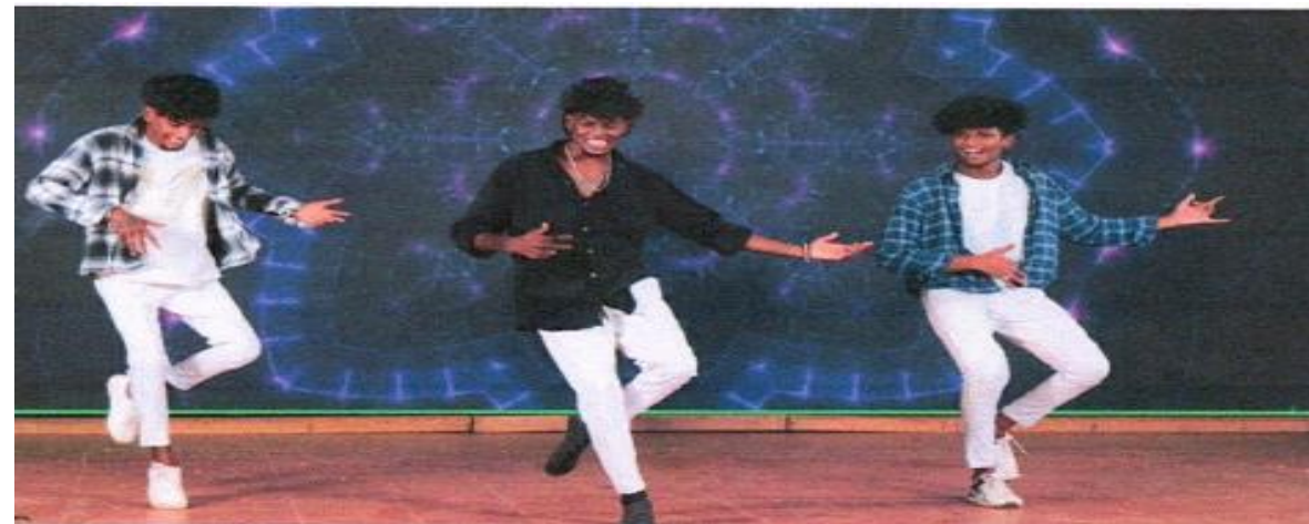
Group Dance event