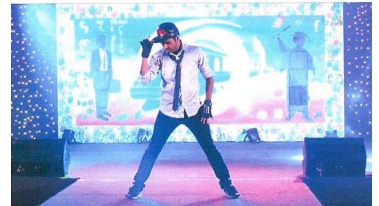
Western Dance Performance-2K18