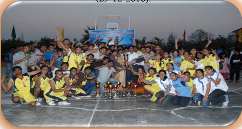
Students Participated in D7 Zonal Sports Meet, Hyderabad (15-12-2019)