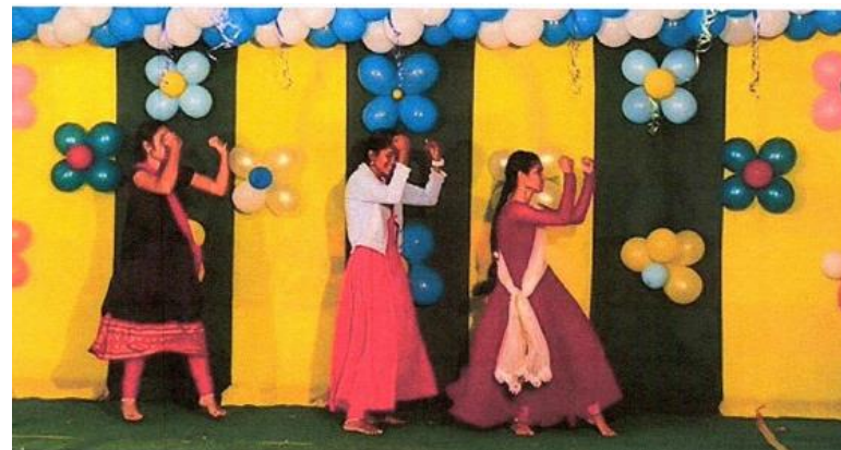
Folk Dance Performance-2K22