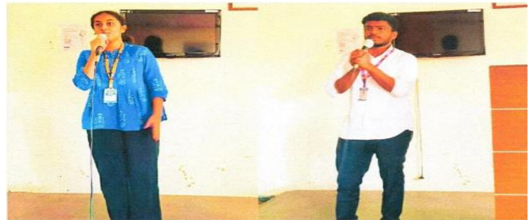
The Elocution Competition