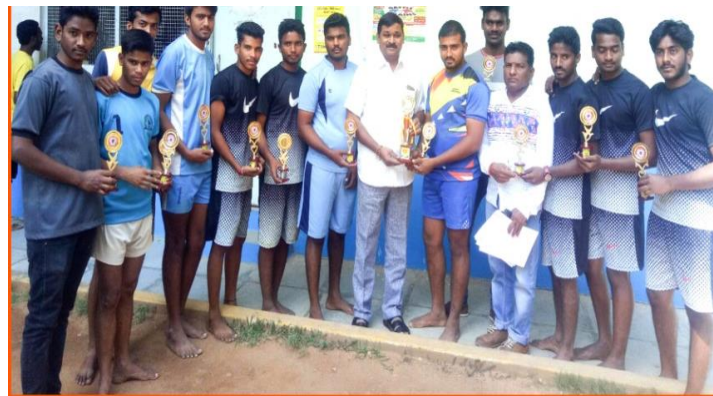
Kabaddi winners team