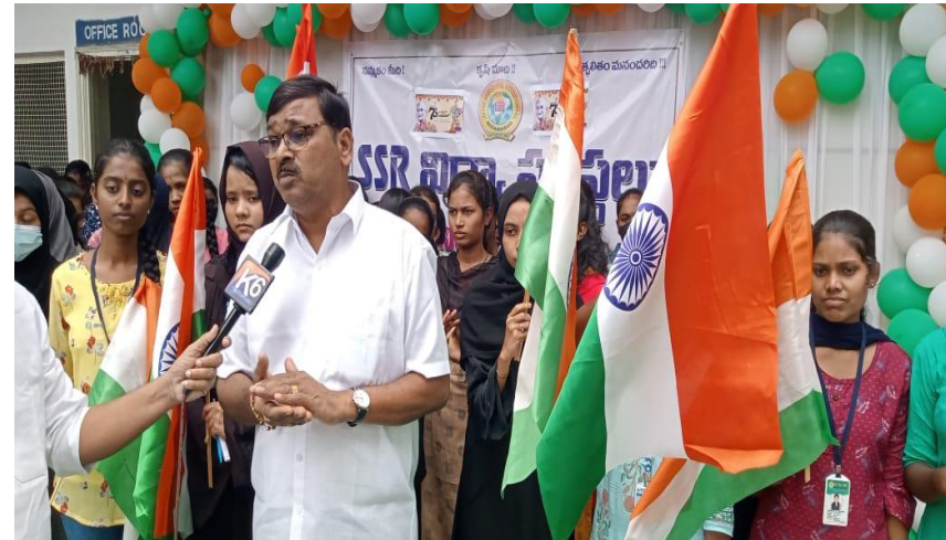
celebrating Azadi Ka Amrit Mahotsav