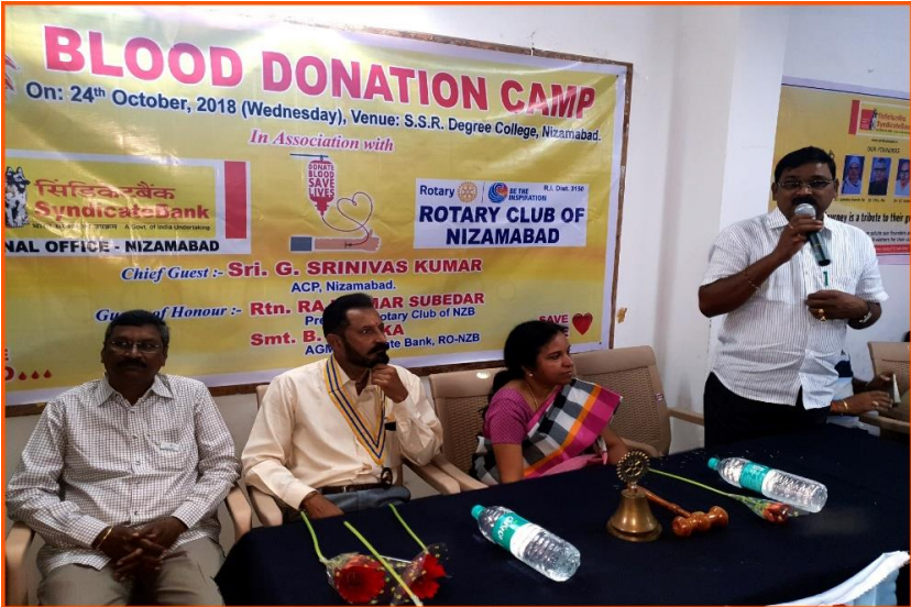
Blood donation camp conducted by college in coordination With Rotary Club