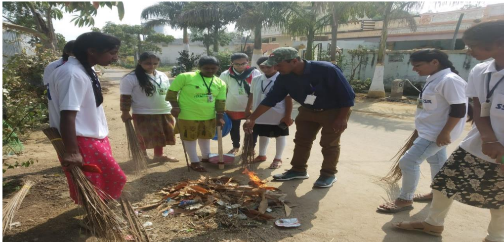
Swachh Bharath Program