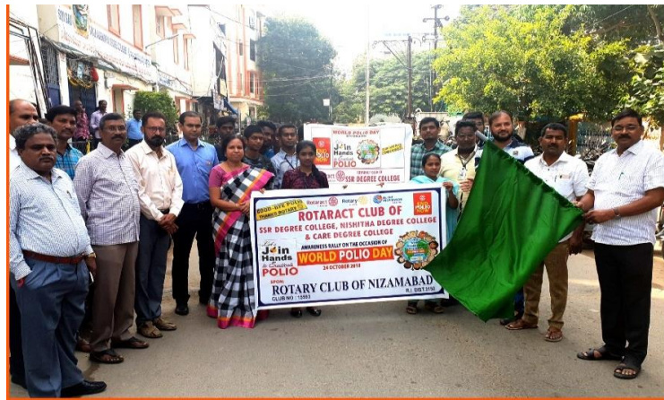
NSS Volunteers and students creating awareness on Pulse Polio