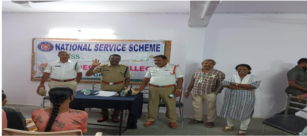
Awareness On Traffic Rules