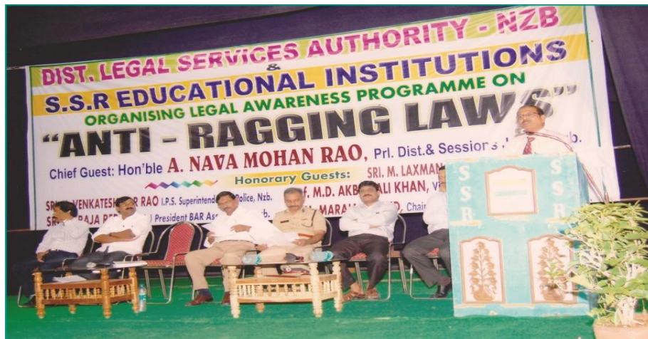
Anti Ragging Law