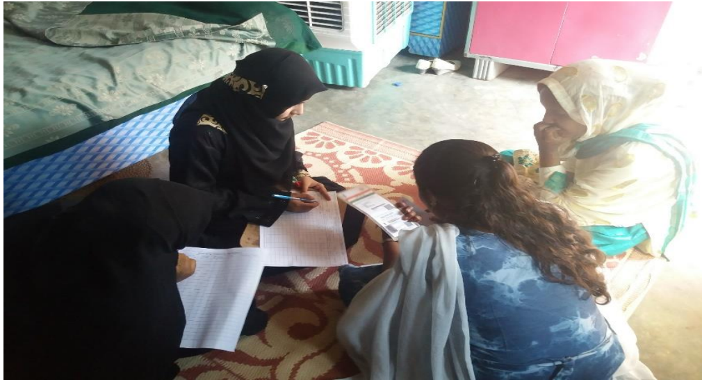
A medical camp conducted