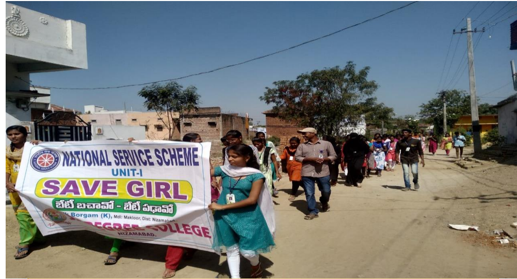
SAVE GIRL Child Awareness program