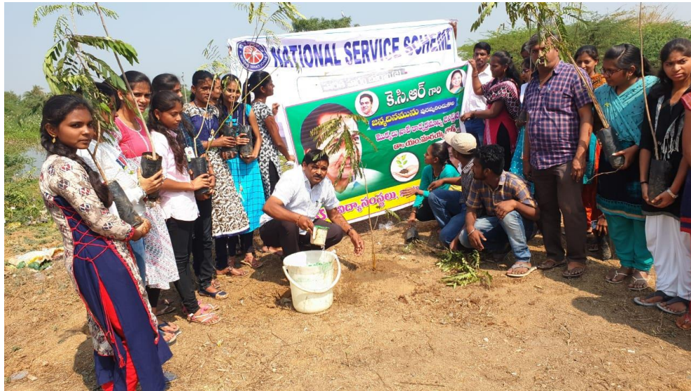
Harithaharam activity by Students