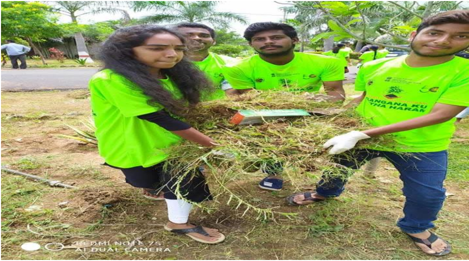
Clean Campus Program at TU