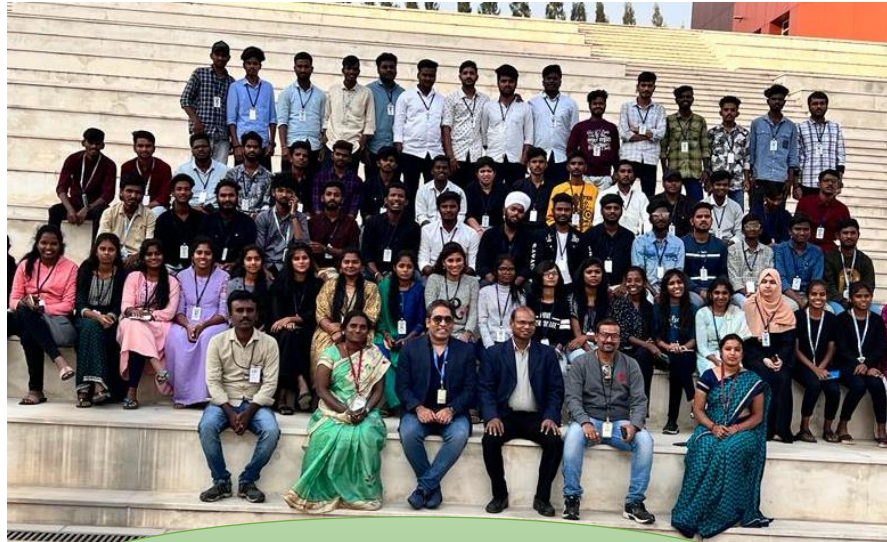
Industrial visit to Infosys