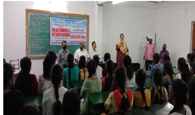
NSS volunteer participation in Legal Awareness program