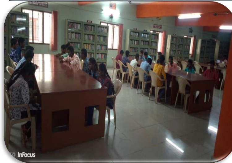
Library Reading Section